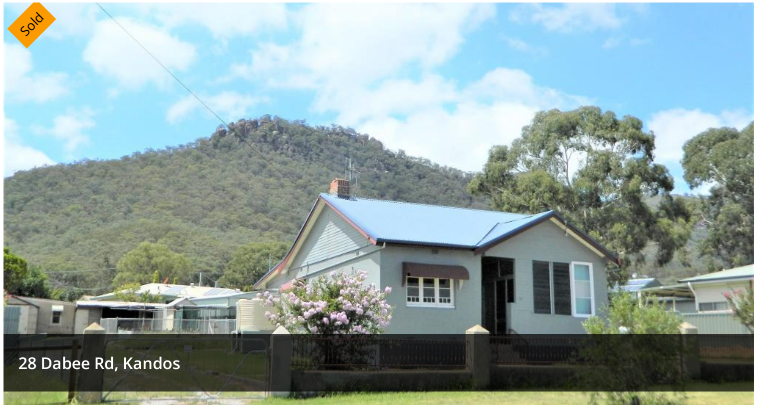
28 Dabee Rd, Kandos